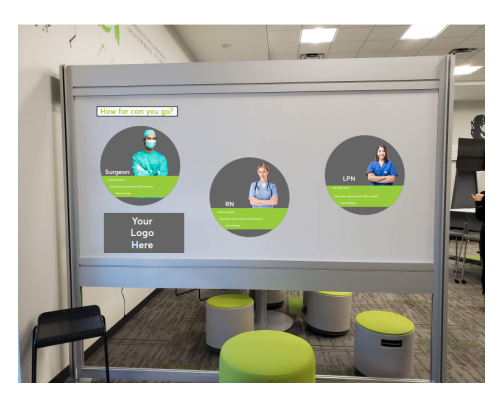
Includes logo and 3 careers to highlight in that industry